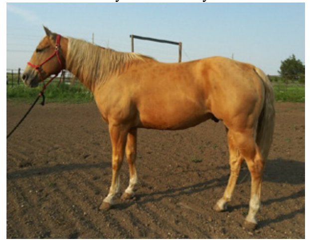
CONGRATULATIONS TO TODD HABBERMAN, Nebraska, Sold Top Sale Horse for $7,750!!; Lot 20 is a handsome one owner, 8-year old been there, done that ranch gelding sold to Deone Hart, SD

It was a super sale for the waning days of summer and good weather as well. Sold 101 head with just a couple No Sales. Thank you to our Buyers & Sellers.