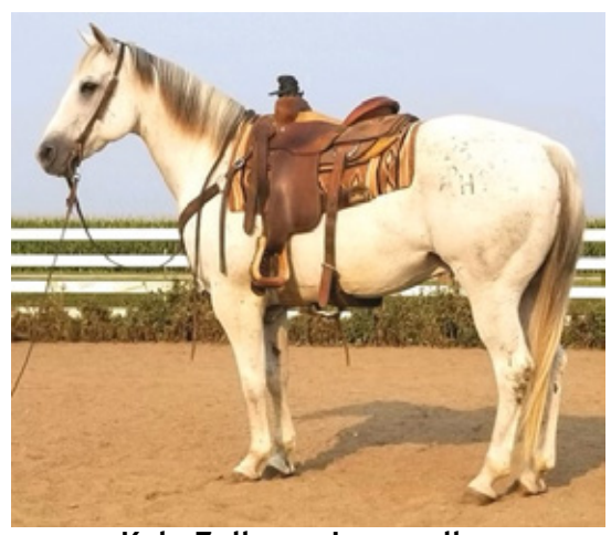
Kyle Zellmer, Iowa sells Reserve Top Sale Horse for $7,500!! Lot 33 is a exceptional 15 year old Head & Heel gelding as well as solid trail horse & sold to Dann Fischer, SD