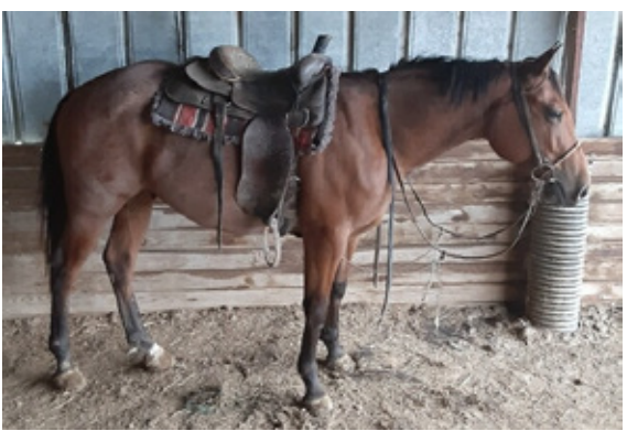
LOT 12 RED PINE HANCOCK 5958053

I am offering 3 full siblings for sale. Very quiet smart horses that start in the spring just like you left them in the fall. Very good looking well built mare. I am impressed on how fast she learns and retains. Not much time on her. She needs a better handle on her for side stepping, backing and a better stop. Would take a good cowboy a few days to finish her.