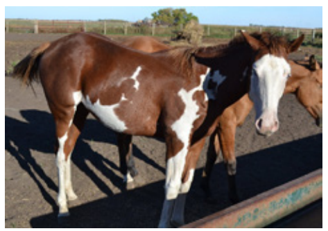
TAG S-3 SELLS GRADE, Yearling Filly (out of paint mare) Sire is Alamitos Sun Joaker, with Sun Frost on his papers, top and bottom, also Doc's Jack Frost & Ciderwood on his papers