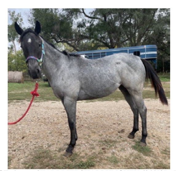
STARBRITECHARLYMONEY 6044537 FILLY COLOR: Blue Roan FOALED: 2020 BREED: OH OWNER: K.A. Deutscher

15.1 hands, 14 year old gray mare. Broke for anyone to ride. Has run poles & barrels. Great trail horse. Good pedigree, sound around.