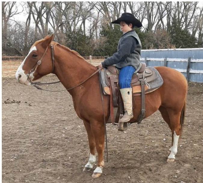
LOT 6 GRADE (TOBY) GELDING COLOR: Sorrel Paint FOALED: 2008 BREED: QH OWNER: R. Steinke

We have used Toby on the ranch calving, trailing and sorting cattle. He has also been used on trail rides. He is easy to be around, gentle, ties good & loads good in the trailer. Grandkids have ridden him. 14. Hands