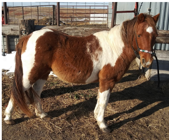
LOT 7 GRADE (SCOUT) GELDING COLOR: Red/white paint FOALED: 2008 BREED: Pony OWNER: E. Hamilton

We have used Toby on the ranch calving, trailing and sorting cattle. He has also been used on trail rides. He is easy to be around, gentle, ties good & loads good in the trailer. Grandkids have ridden him. 14. Hands