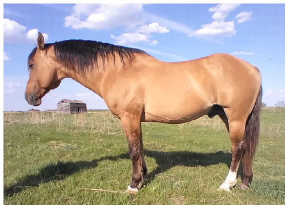
RJ C Wilywood Drift

Skipas Cowboy Snippys Cowboy Kings Cowboy Drift Skipa Cody Tailor Made KateCow Ladys Drifter Fancy on Stage