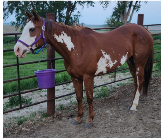
LOT 7 HUSTLE KEE CAT 849,692 MARE COLOR: Sorrel FOALED: 2005 BREED: Paint OWNER: P. Vlotho

This horse has been in our family for at least 10 years, she has been rode in the black hills, many parades including night time lighted parades. She is a great trail horse and absolutely loves attention. She stands great for farrier, loves baths, loads well, and is very easy to catch, 14.3 H. Our daughter is moved on to a faster horse. She is not sound, stiff on front.