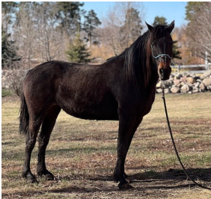
LOT 27 GRADE (PEPPER) MARE COLOR: Bay FOALED 2010 BREED :Morgan OWNER: K. Wendling

12 yr old Tennessee Walker Mare. Diesel is approximately 15 hands tall. She is jet black in color. This horse is a jack of all trades. She has been used for checking fence, moving cattle, 4H trail rides, and does have pulling experience. Diesel comes to a pail and trailer loads well. Easy keeper, good eater and very sound horse.