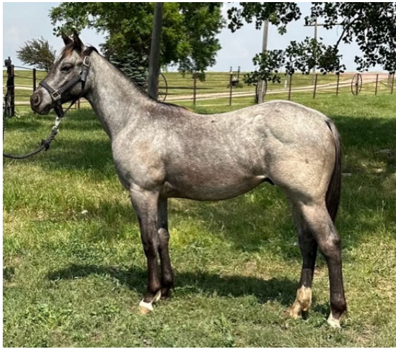
LOT 12 LO DOWN BLUES 6196097 COLT COLOR: Blue roan FOALED: 5/20/22 BREED: QH OWNER: S. Pitz

LOBOS LIL LEO LOBO BLUE LO BLO CASEYS LIL DEB DARK COUNTESS JOY ROMP SANDQUISTS COUNTESS LO BLO LOBOS LIL LEO LO BLOZ DARK COUNTESS MS KING GLO 148 MR BASIC BLACK WHITNEYS BUDDY