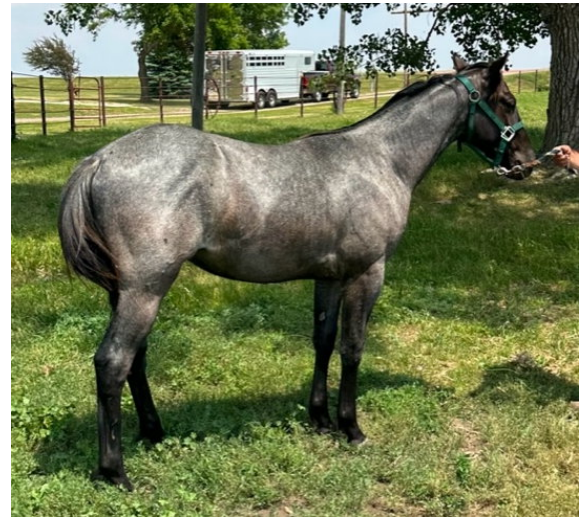
LOT 14 BLU FRITZ (Pending) COLT COLOR: Blue roan FOALED: 5/28/2022 BREED: QH OWNER: S. Pitz

A really nice Grullo colt that is athletic and very pretty headed. He has a neat pedigree with three crosses back to Mr Basic Black, two crosses to Dont Doc also. A super all-around ranch and cow horse prospect.