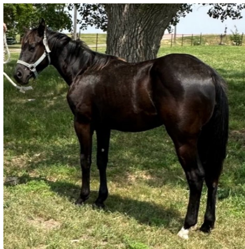
LOT 11 BLO N BLACK 6196101 COLT COLOR: Black FOALED: 5/29/2022 BREED: QH OWNER: S. Pitz

A big stretchy Blue colt with two rear socks. A very sweet disposition, big kind eye and a very trainable temperament. He will be a great all-around ranch and cow horse gelding prospect. Should grow up to over 15 hands.