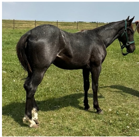
LOT 10 A LO BLO COYOTE 6196098 COLT COLOR: Blue roan FOALED: 5/23/22 BREED: QH OWNER: S. Pitz

Lo Blo has been our senior sire for the last decade. He has produced colorful, fancy, athletic colts with a lot of style and personality. They have made great reining and working cow prospects as well as ranch, roping & family horses too.