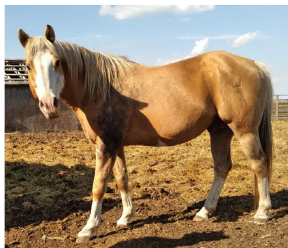
Alamitos Sun Joaker

Wilywood Orphan Drift RJC Wilywood Drift Oui Oui TKM Ashley Pocodo Pocodo Driftwood Poco Amber Drift