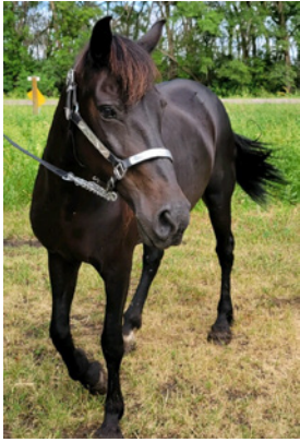
LOT 26 GRADE(DIESEL) MARE COLOR: Black FOALED: 2011 BREED: OWNER : TR Sullivan

12 yr old Tennessee Walker Mare. Diesel is approximately 15 hands tall. She is jet black in color. This horse is a jack of all trades. She has been used for checking fence, moving cattle, 4H trail rides, and does have pulling experience. Diesel comes to a pail and trailer loads well. Easy keeper, good eater and very sound horse.