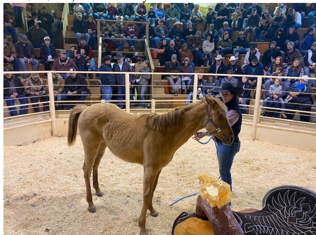
Consigned by JEM Solutions, NE, she brought $4900