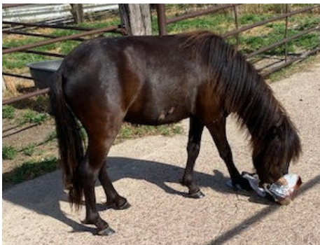
LOT 28 GRADE (ELVIS) STALLION COLOR: Black FOALED: 2021 BREED: MINI OWNER: KIDS

Selling this morgan for my friends. There kids road her all around the back roads with their friends. She will saddle up and head down the trail with out any struggle and will go all day long.. She loads good in the trailer, ties good, only down falls she has is she is hard to catch in a big pasture and some prior owner left the halter on and made a little blemish on her nose. 13.5 hands.