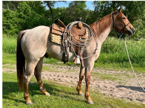
LOT 4 SPOONS STRAIT N RAMBO 1096035 GELDING COLOR: Red Roan FOALED: 2019 BREED: Paint Owner: J. Paxton

Blue is a 12 year old gelding he has done it all, been in the mountains on hunting trips used for branding/ doctoring used him to round up horses. He is a very fast horse but is well mannered, loads like any good ranch horse and can be road by any kid or adult . He does have a little bump on his side, the vet said it could be removed but it would not ever bother him. 15.5 hands.