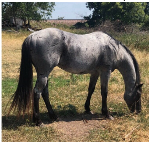
LO BLO 4827347 - Reference Sire