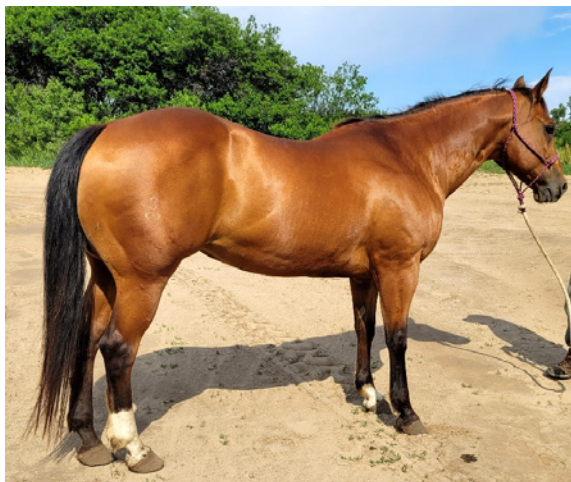
LOT 9 SPANISH AMBER WATCH 4290581 MARE COLOR: Bay FOALED: 2002 BREED: QH OWNER: W. Sievers