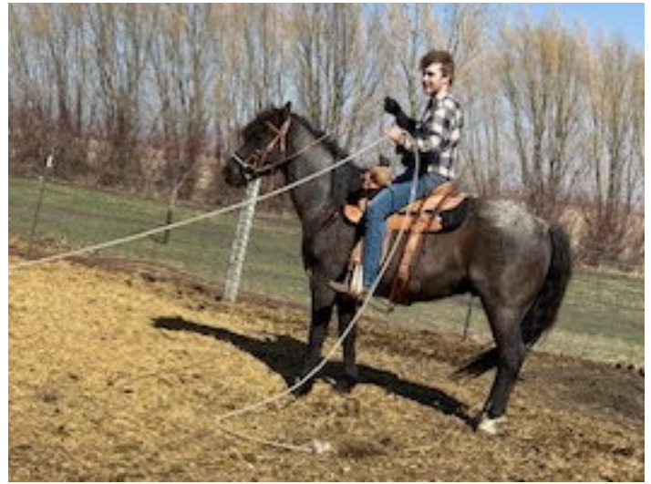
LOT 3 GRADE (BLUE) GELDING COLOR: Blue Roan FOALED: 2011 BREED:QH OWNER: C. Tikka

ON THE COVER - SOME OF THE SPELBRING YEARLINGS THAT SELL AT 12:30 pm. 20 HEAD IN ALL SELL