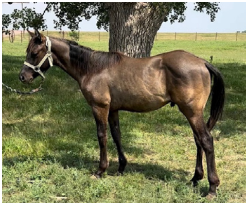
LOT 13 LITTLE LO RIDER 6196102 COLT COLOR: Grullo FOALED: 6/4/2022 BREED: QH OWNER: S. Pitz

This is a very fancy colt that is double bred Lo Blo & Mr Basic Black on the bottom side. He's got the look, color and chrome. Lo Down Blues is athletic, shapely, super kind and forgiving. A great reining, working cow horse prospect or stud prospect.