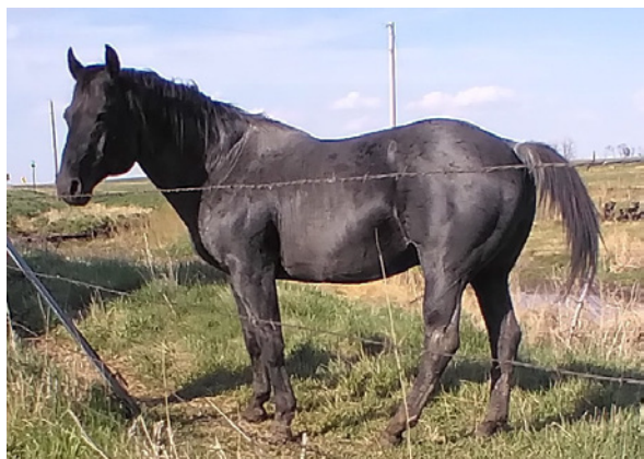
Kings Cowboy Drift

Skipas Cowboy Snippys Cowboy Kings Cowboy Drift Skipa Cody Tailor Made KateCow Ladys Drifter Fancy on Stage