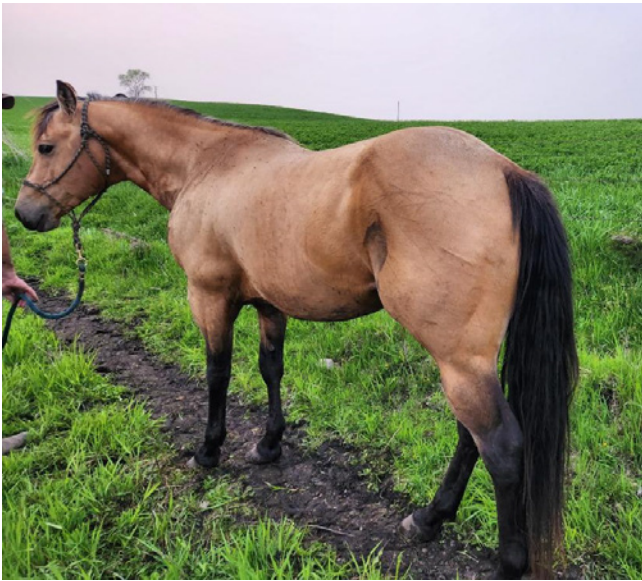
LOT 1 GUNSMOKE DUNIT 58983381 STALLION COLOR: Buckskin FOALED: 2018 BREED: QH OWNER: R. Gzmowski