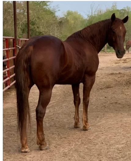
LOT 20 FOXY SNOW KATT 5555640 MARE COLOR: Chestnut FOALED: 2013 BREED: QH OWNER: B. Pederson

PHONE BIDS WELCOME - call before sale day to make arrangements