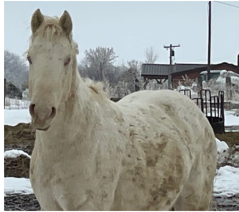
POCO GHOST 6138485 STALLION COLOR: Cremello FOALED: 2021 BREED:QH OWNER: R. Hammrich

THIS 2-YR OLD STALLION SELLS AT THE END OF THE LOOSE HORSE SALE, approximately 12:30 pm - AS IS NOT HALTER BROKE.