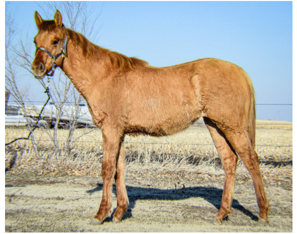
LOT 4 JEM COOL RUNNINGS 620509 FILLY COLOR: Red Dun FOALED: 5/21/2022 BREED: QH OWNER: JEM Solutions LLC

NOTICE - ALL HORSES IN THE CATALOG COME WITH A NEGATIVE COGGINS TEST as well as all out of state horses. All Out-Of-State Buyers, please be sure to pick up your health from our onsite Veterinarian upon leaving. Its the law.