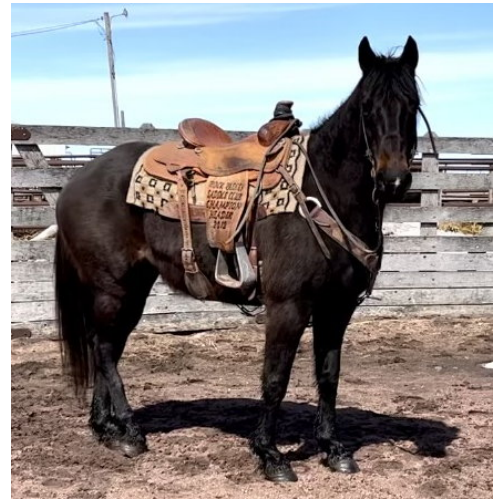
LOT 12 COLONELS RUGGED BLUE 5340229 GELDING COLOR: Bay FOALED: 2010 BREED: QH OWNER: McGregor Livestock

ON THE COVER - LOT 2 with his owner, Bruce Bebo