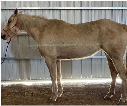
LOT 10 FANTASEE DRIFTER 5957697 FILLY COLOR: Palomino FOALED: 5/5/2019 BREED: QH OWNER: E.G. Wurtele

NU CASH DRIFTER NUWOOD CASH CASH DRIFTER COTY CBH MEGA DRIFTWOOD SWEET COTY GLO BASIC BLACK SPRUCE GLAYZ BUDDY BARON BONANZA HOTROD HOTRODS ROYAL BUCK FANTASEE SHADY LEO ROAN BELL BONANZA FAN SEE A STAR SHADY LEO LANE MISS CAMP STAR