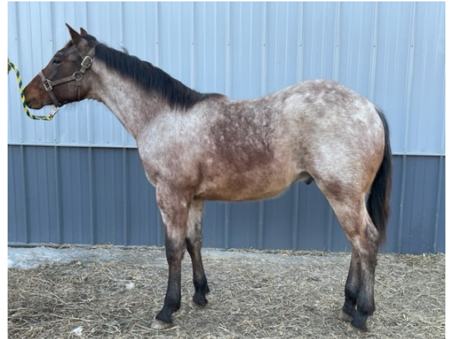
LOT 5 KODY ROAN ACK 6180731 STALLION COLOR: Bay Roan FOALED: 5/30/2022 BREED: QH OWNER: B. Erickson

Pretty headed red dun filly with a great conformation and even better disposition. She is an all around prospect that will get you noticed in or out of the show ring. This filly is athletic and built to last all day. Her mother is an own daughter of the notorious, AQHA Hall of Fame horse, Sun Frost.