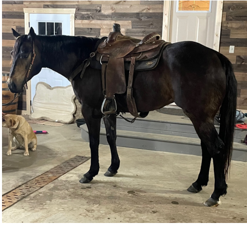
LOT 2 TORY CREEK CARTEL 5843951 GELDING COLOR: Buckskin FOALED: 2017 BREED: QH OWNER: B & S Bebo

BUSY HAIDIN HAYTHORN LEGACY FIGURE FOUR MS 529