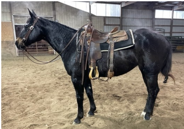
LOT 23 DAISYS NEW PLAYMATE MARE COLOR: Brown FOALED: 2015 BREED: QH OWNER: C. Dyer

Rain is a 7-yr old mare. A very gentle, 14.3hands. Picks up both feet for the farrier. She is ready to be finished to be your next ranch hand or trail riding partner.