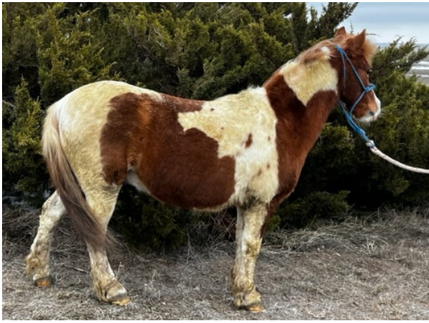
LOT 18 GRADE (MIKEY) GELDING COLOR: Sorrel/white FOALED: 2003 BREED: PONY OWNER: Nagel Enterprises, LLC

Mikey is a 10 year old paint 10.3 hand pony gelding. If you are looking for a cowboy/cowgirl working pony for your cowboy/cowgirl that can cover ground like a big horse this is your pony. He has been used to pen & move cattle at the sale barn, has had tarps put on him and drug them around, been ridden out in the open. He has started learning how to open gates. See video on our website, SDHorseSale.com