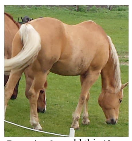
Nadine Renteria, also sold this 19 year old Reg.AQHA gelding for $4,100!

U -11, Owner C. Schrock sold palomino gelding for $4,900 (Reserve top sale horse)