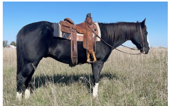
LOT 11 GRADE (BUBBA) GELDING OWNER: K. Wolf sold this 10 year old gelding for $3,000