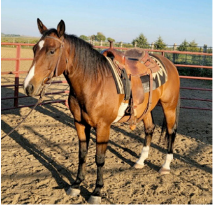
OWNER: N. Renteria sold this 8-yr old reg. AQHA gelding for $3,700.